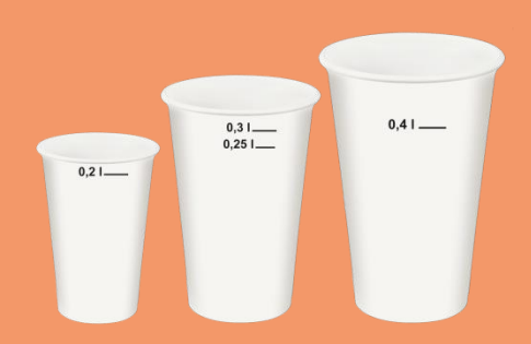
Hard paper cups