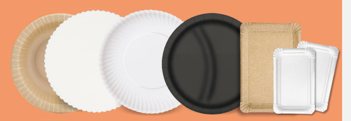
Paper plates | Menu plates | Tart plates | Bowls